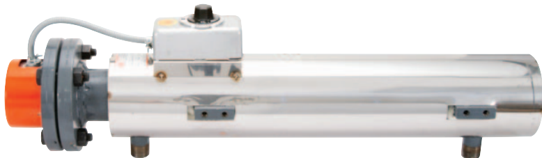
Circulation heater with optional externally mounted thermostat.