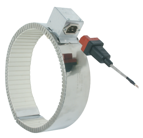
One-Piece Band Standard Termination Location: opposite the gap; center of width

* Minimum Inside Diameter: 2-1/2" (63.5 mm)