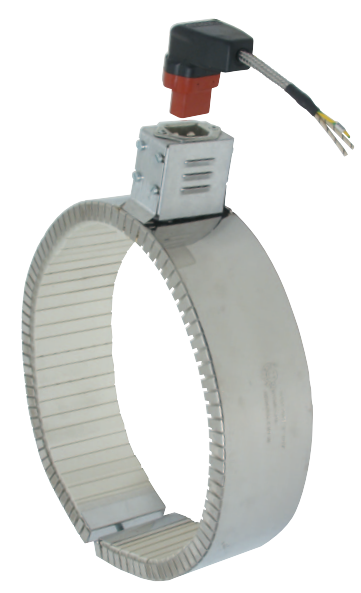
One-Piece Band Standard Termination Location: opposite the gap; center of width

** Minimum Inside Diameter: 3" (76.2 mm)