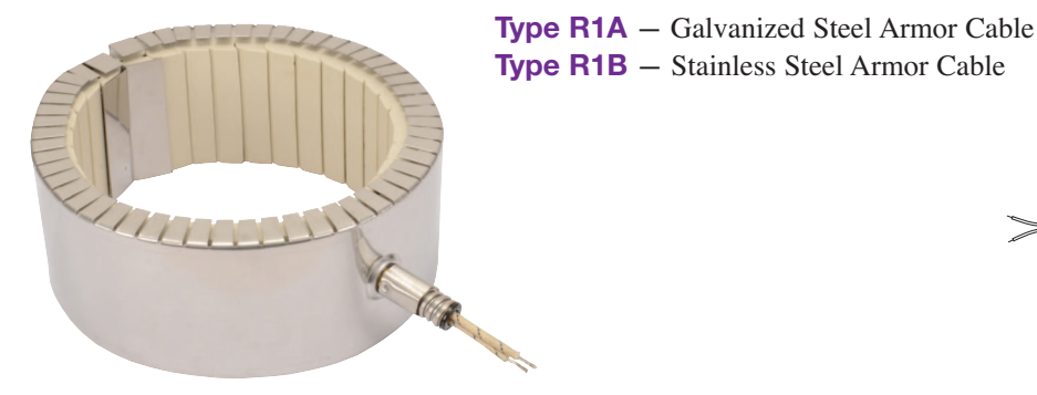
One-Piece Band Standard Termination Location: opposite the gap; center of width

If longer leads or electrical connectors are required, specify when ordering.