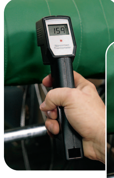
Bare barrel temperature: 624°F (329°C)

NOTE: The above information is to be used for comparisons only. Actual results in your plant on your injection molding machines may differ.