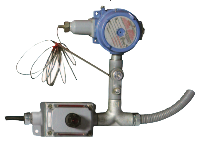
NEMA 7 Thermostat Control Assembly with High Limit Indicator Lamp

Class I Division 2: Groups A. B. C and D Class II Division 2: Groups F and G