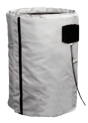
55 Gallon Single Zone Full Coverage